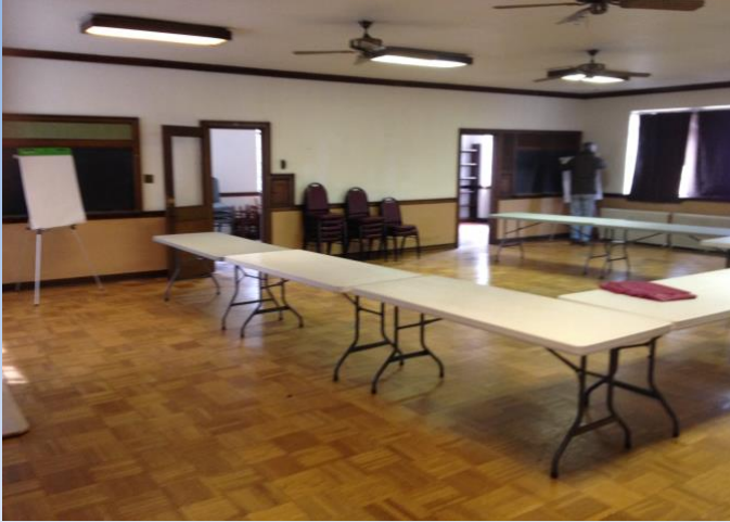
Current Use Setup

6001 Germantown Avenue, Philadelphia, PA