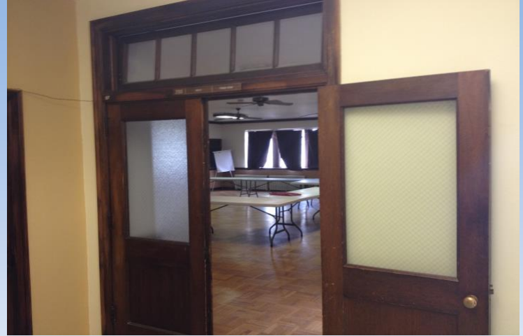
2 nd Floor Dedicated Entry