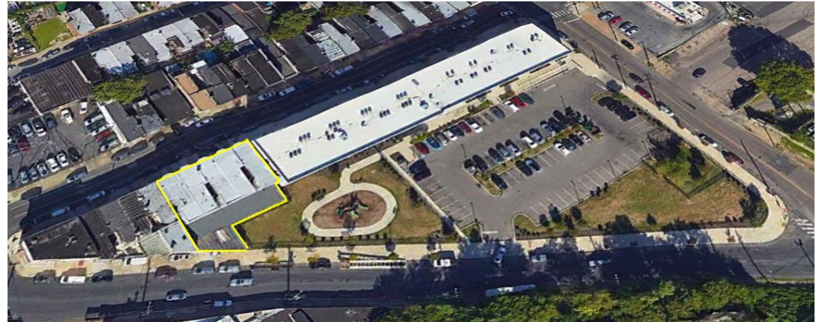
435 Rising Sun Avenue