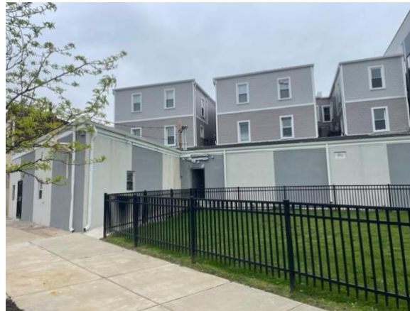
435 Rising Sun Entry: